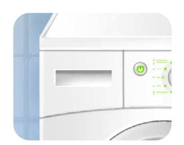
STEP 1 Add dose directly into automatic dispenser drawer.