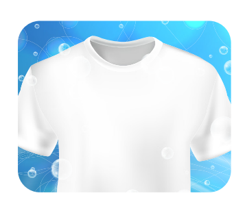
Follow on-pack dosage instructions. For heavy soiling increase dosage.